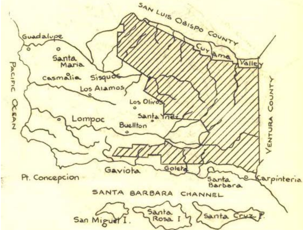
OUTLINE MAP OF SANTA BARBARA COUNTY SHADED AREA SHOWING SANTA BARBARA NATIONAL FOREST