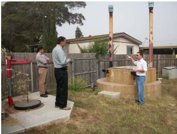
Romtec engineer explains details of lift station replacement.

County Parks staff met with representatives from Romtec Engineering to review a bid for replacement of the antiquated wastewater lift station. A comprehensive bid for turnkey installation of a new, automated lift station will be forthcoming. This improvement will drastically reduce the likelihood of a sewer spill.