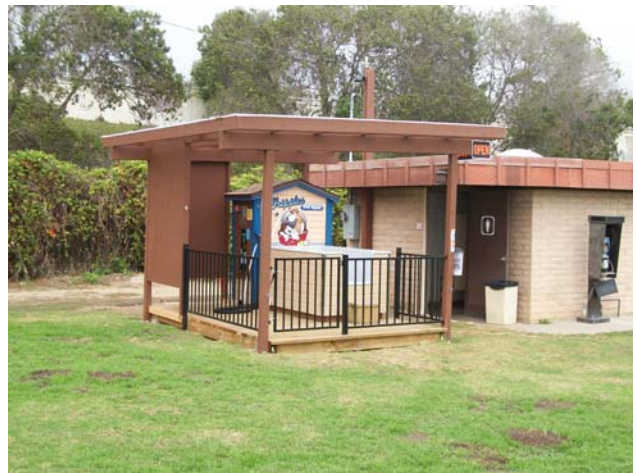
New Wripples Pet Spa ready for grand opening at Lookout Park on Sept. 18